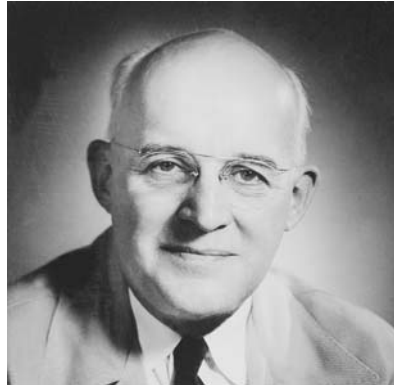
Warner Elias Sallman

The pictures on left and right are replicas of worldwide famous paintings created by Warner Sallman, below, who was of Finnish origin.